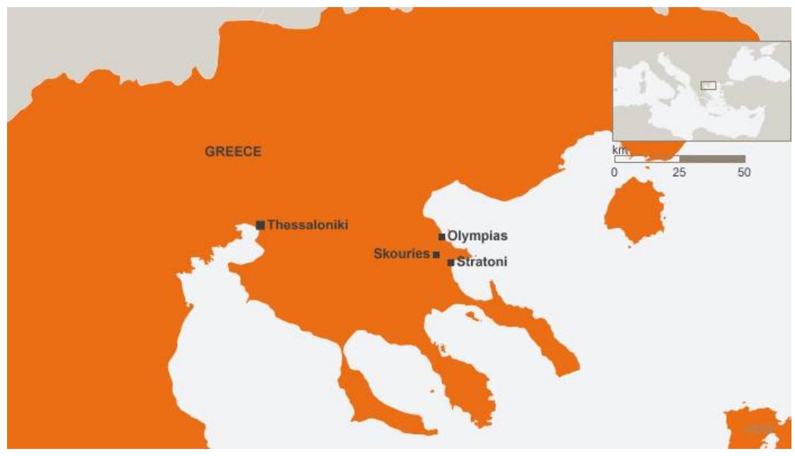
Figure 1: Map of northern Greece, including mining spots

The reading of the arguments cannot be regarded as complete but under process of change and evolution. This peculiarity consists in the time period in which the field research takes place in the study area while the mining exploitation is in its beginning stage.