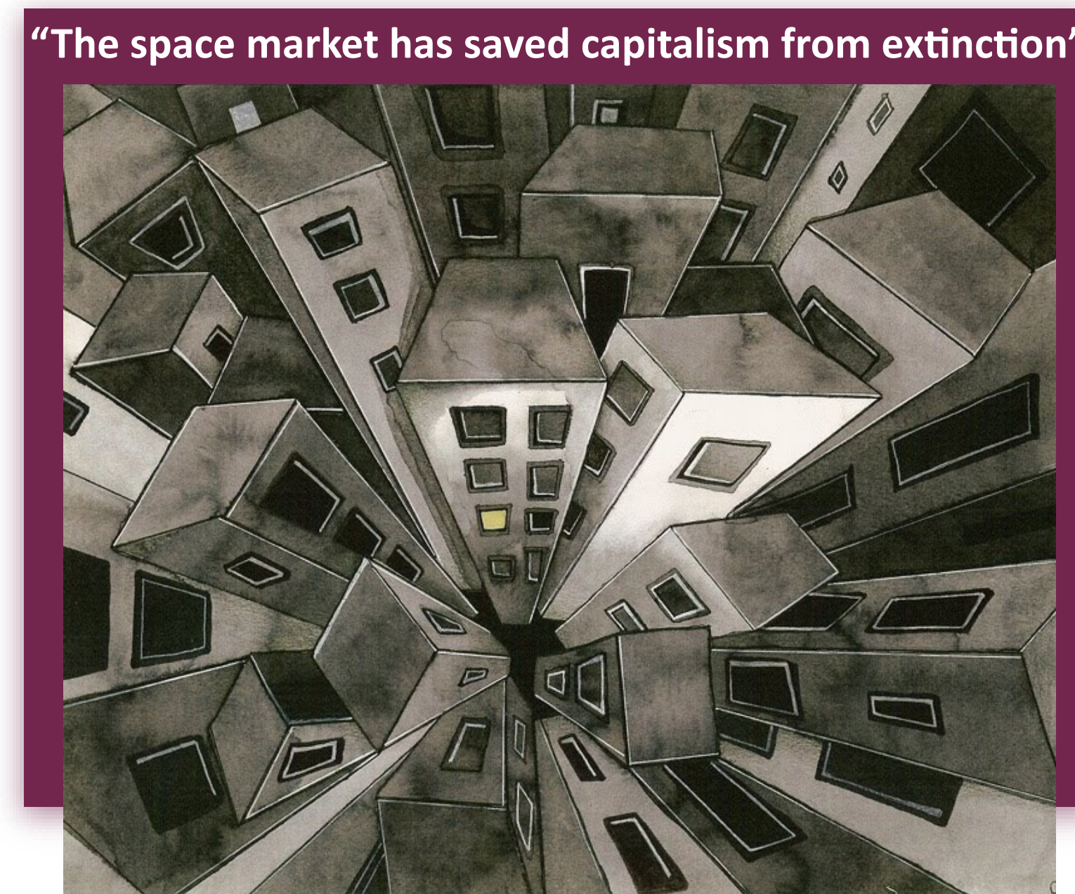
"City" by Celine Meisser

Space is produced and reproduced through human intentions. Currently, the push of the neoliberal dogma for the creation of markets in the sea has unveiled a battle between those who "produced space for domination" (profit accumulation) or the "production of space as an appropriation to serve human need" (human right).